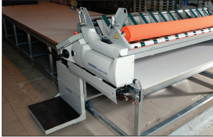
Optional platform allows operator to ride alongside the table